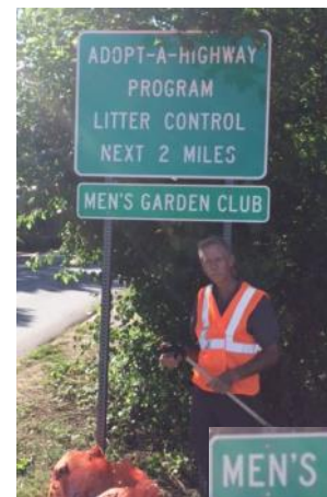
Litter Pick Up June 18 th