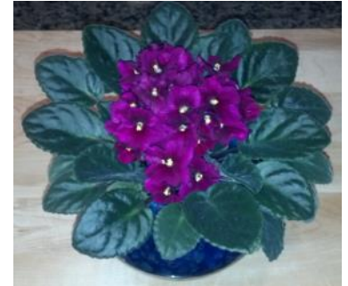
It Only Took 20 Years! To grow a perfect African Violet. ~ the editor

The strainer was installed in the irrigation system. The new ground fabric is scheduled to be installed. It is also our goal to have the additional shade structure built prior to the fall sale. A big thank you to SCC for spreading gravel on much of the Club's nursery driveway and for repairing a leak at the water meter valve.