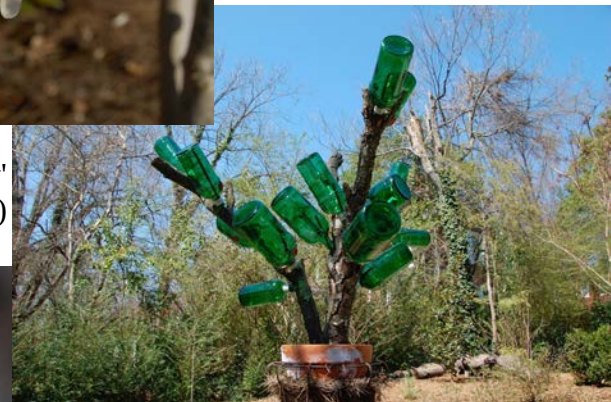
Bottle bush 'Tanqueray' (Bottle Tree)

Bring check or cash & completed form to Joyce Crescenzi.