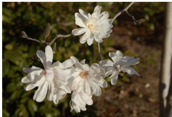
Magnolia 'stellata' (Deciduous magnolia)