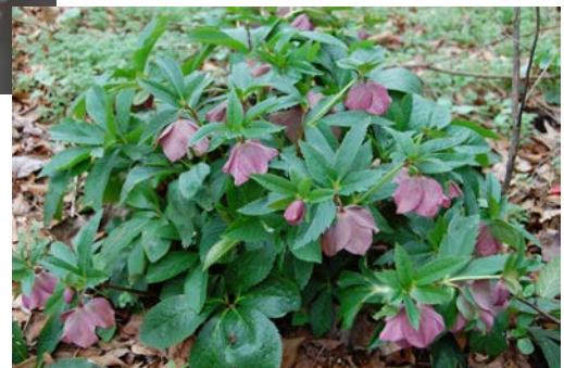
"Helleborus purpurascens" (Purple Hellebore)