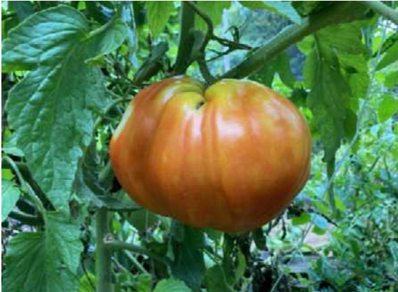
A tomato variety from Pam Datwyler at the April SMGC meeting: she gave me this whopper called 'Goat Bag'!