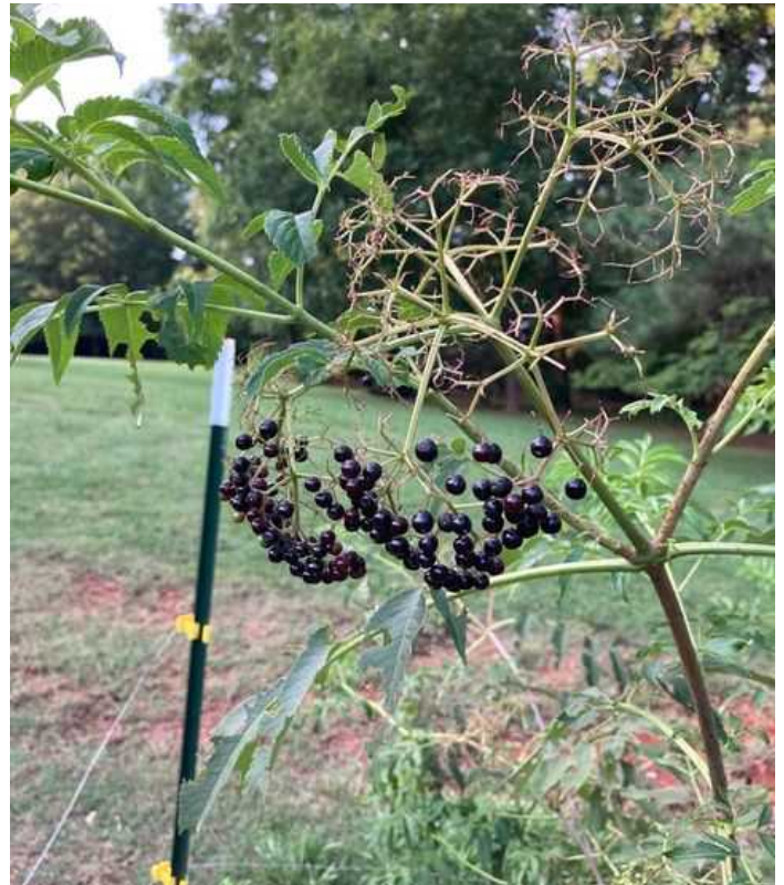
Another first attempt: Elderberries. This variety is called 'Ranch'. Sambucus canadensis 'Ranch'.

Our Corporate Members are listed below. Please support them.