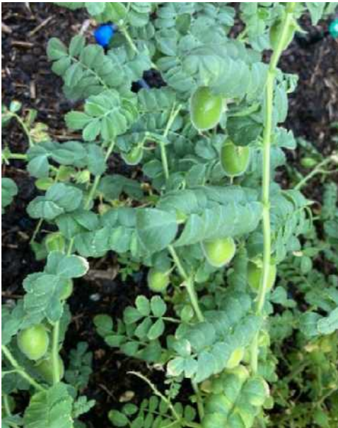
My first attempt at growing chick peas (aka garbanzos). Lesson learned: you need to plant a lot.